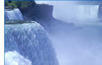
World's most famous Falls