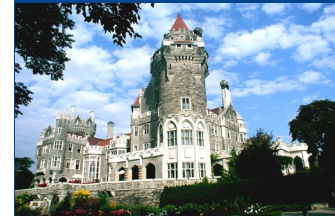
Magnificent Casa Loma Castle in Toronto