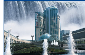
Gaming at Fallsview Casino